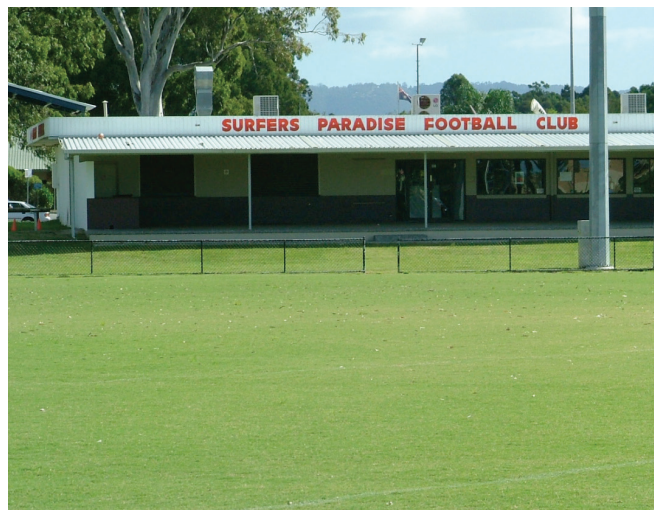
Sports field application