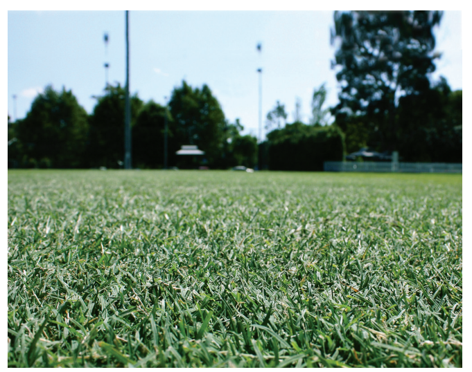
Sports field application