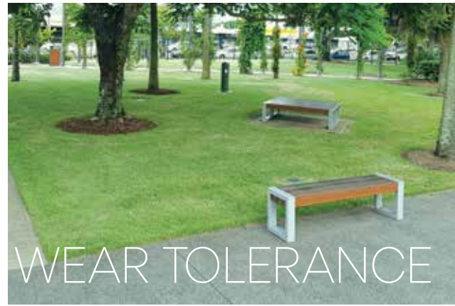
DROUGHT & WEAR TOLERANCE

Roadworks – Road developments use Nara™ as the specified all-round champion as it: