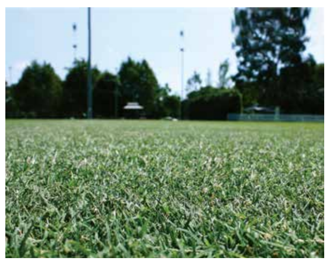
Sports field application